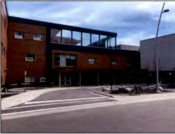
Healing Spirit House

The Provincial Assessment Centre is located inside Healing Spirit House at the North end of the Riverview lands, 2721 Lougheed Highway in Coquitlam, 3 rd Floor .