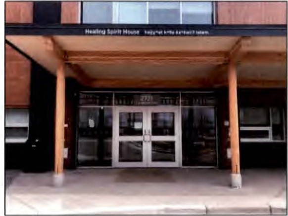
Front Door of Healing Spirit House

To find Healing Spirit House on the Riverview lands, you can follow the Bus Route signs or the brown directory signs that point the way to us.