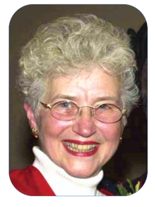
Message from the Chair