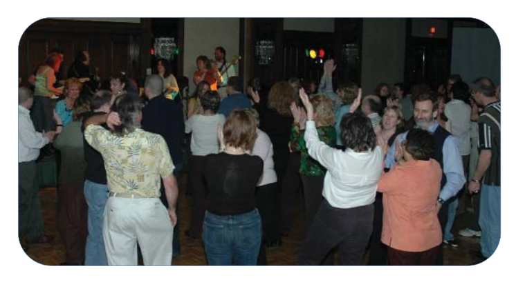
Blues band Super 9th entertaining staff on Thursday evening.

Fun: "Let's not take ourselves too seriously; let's have fun and enjoy our work."