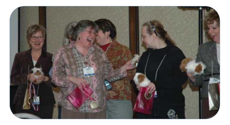
Development Site members receive their 'guinea pigs.'

the very valuable role that each team member played in 'field testing' key components of CLBC's new service delivery model.